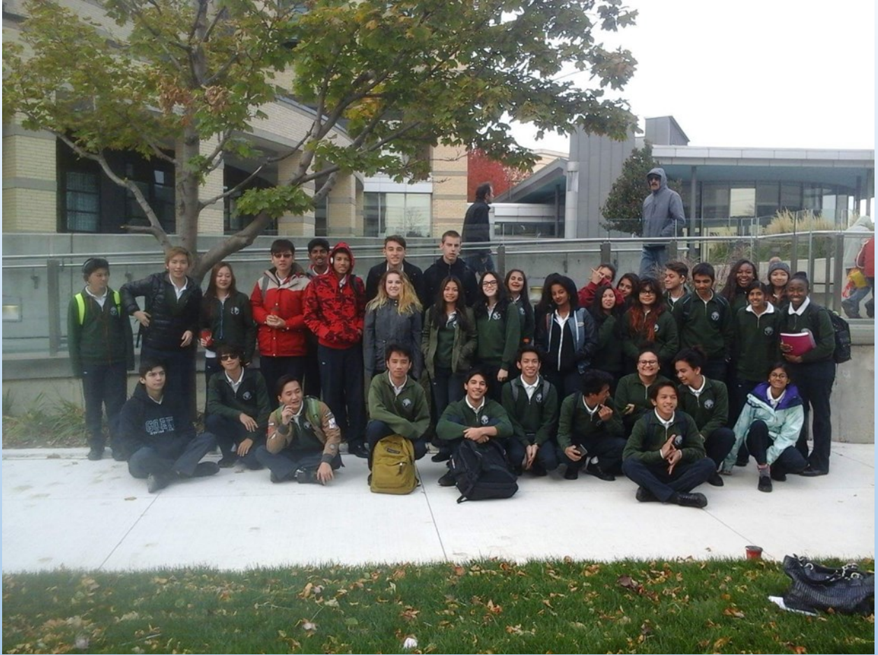
Gators outside the Mississauga Central Library