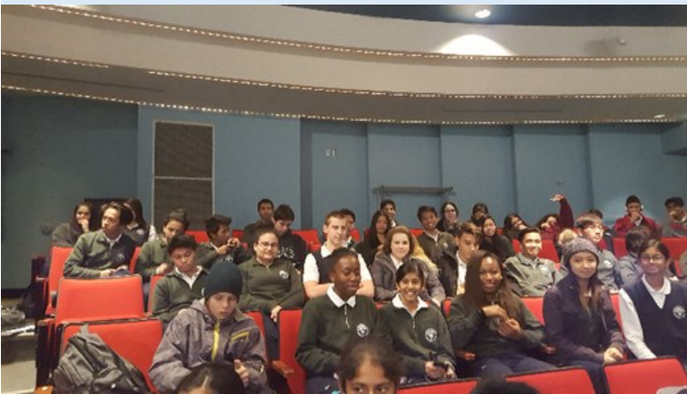
Gators in the Noel Ryan Auditorium waiting for the presentation to begin

On November 26, 2016, thirty-six Gators attended a teen presentation at the Mississauga Central Library delivered by award-winning Canadian author Eric Walters. We were so impressed with the amazing life experiences Walters has had and that have inspired more than 100 novels!