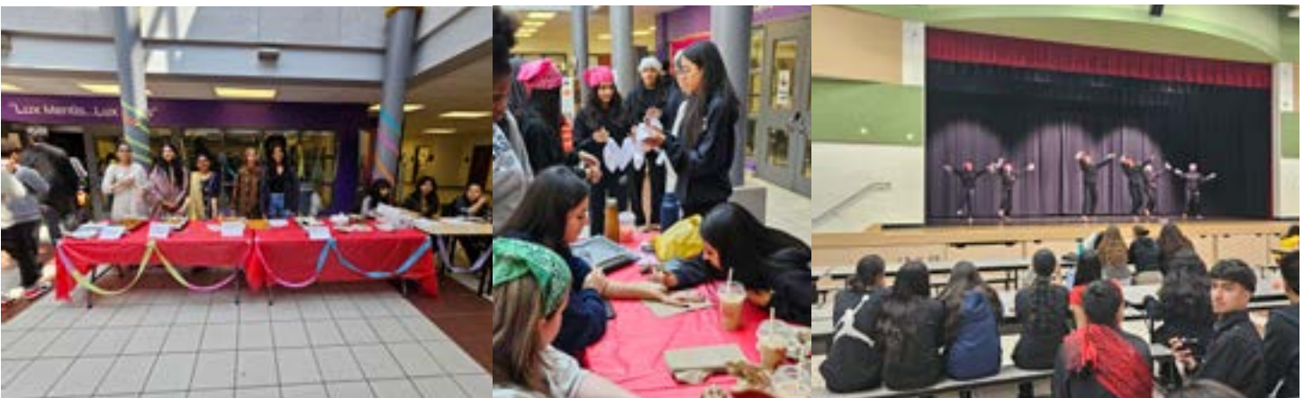
On May 16, St. Roch Catholic Secondary School held its first South Asian Culture Day. It was a fun and educational celebration for all. There was South Asian food, cultural performances and a school wide cultural dress down day. There was also a free Mehndi booth where students got beautiful designs drawn on their hands.