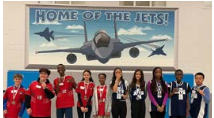
On May 10, St. Isaac Jogues Catholic Elementary School hosted an Educational Quiz Bowl. Nine schools were represented in the competition. Teams of five students worked together to answer trivia questions based on the Ontario curriculum. There were also categories in General Knowledge and Current Events. St. Evan and St. Isaac Jogues went head-to-head in the finals with St. Evan winning by a mere seven points. Parents and teachers alike were impressed by the breadth of student knowledge in this display of Catholic Education in action.