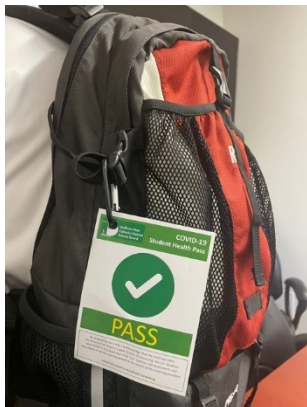
Figure 2 Sample pass on Backpack

Another option is to display a card with a check mark on it which indicates as well that they have undertaken the screening and are able to come to school.